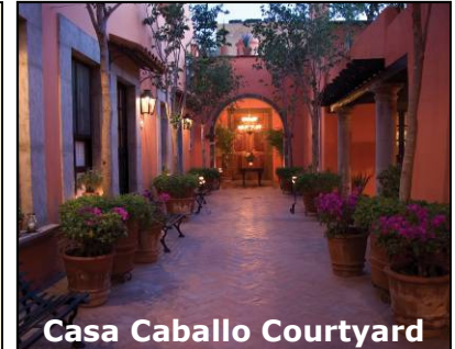
Casa Caballo Courtyard