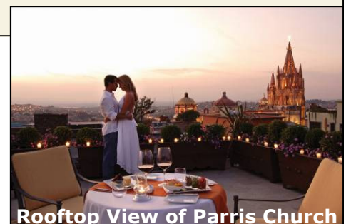
Rooftop View of Parris Church