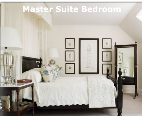
Master Suite Bedroom

Adjoining rooms must be confirmed through property directly.