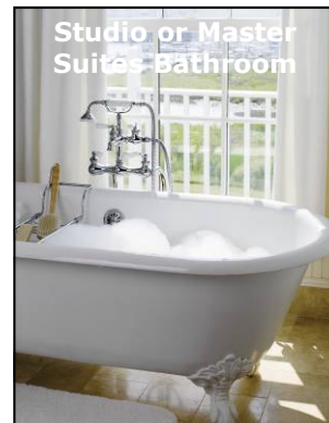
Studio or Master Suite Bathroom