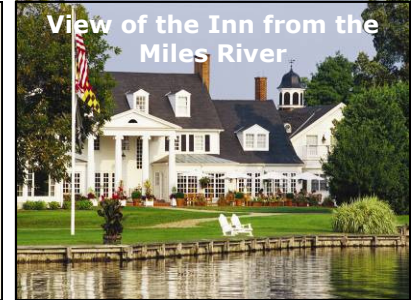
View of the Inn from the Miles River