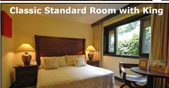
Classic Standard Room with King