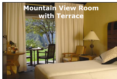
Mountain View Room with Terrace