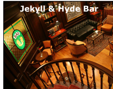
Jekyll & Hyde Bar