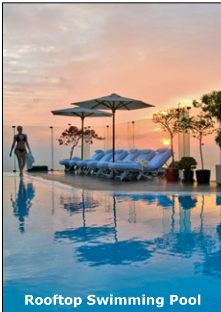
Rooftop Swimming Pool