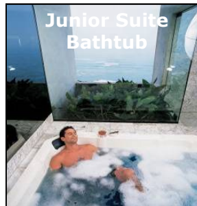
Junior Suite Bathtub