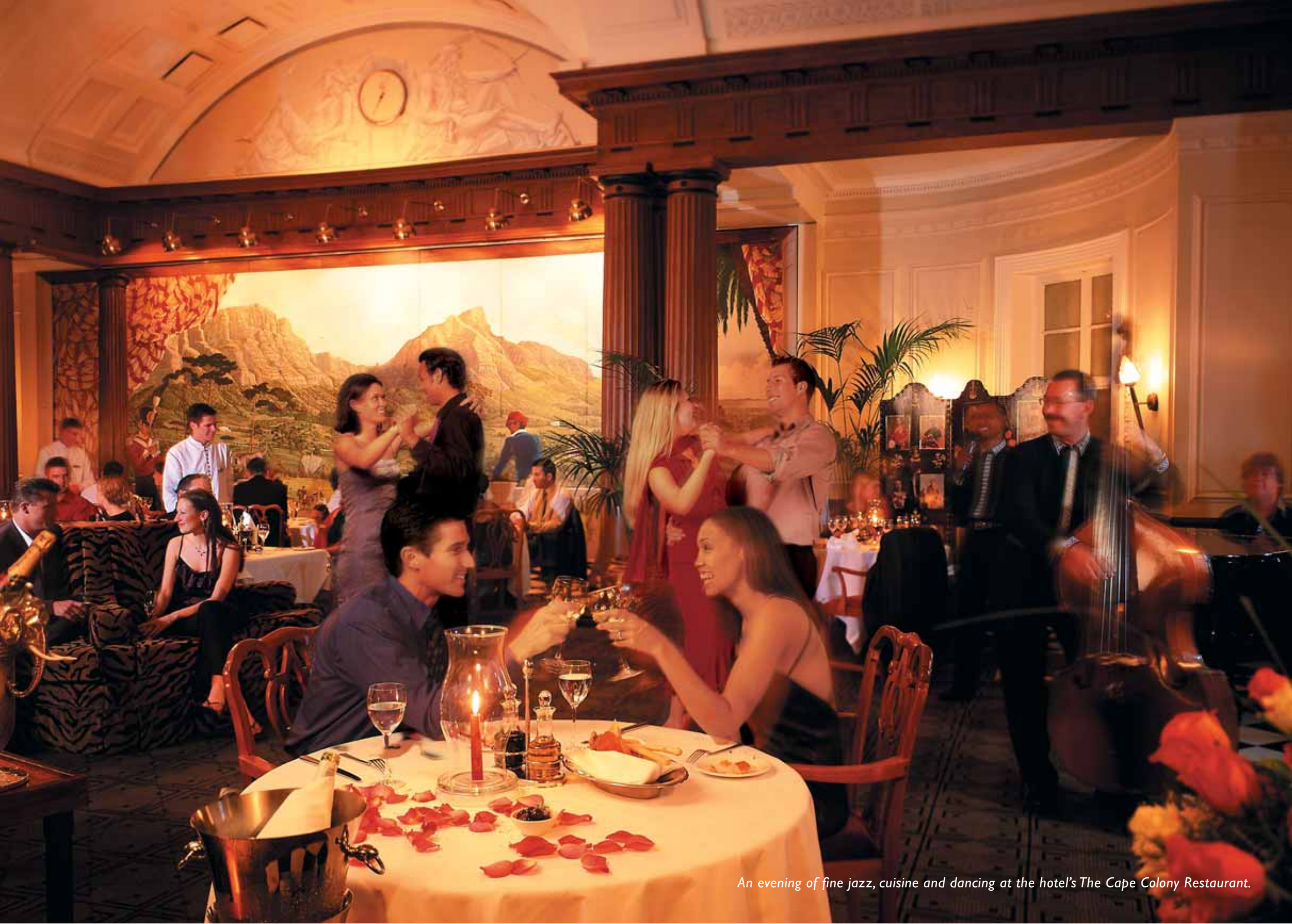
An evening of fine jazz, cuisine and dancing at the hotel's The Cape Colony Restaurant.