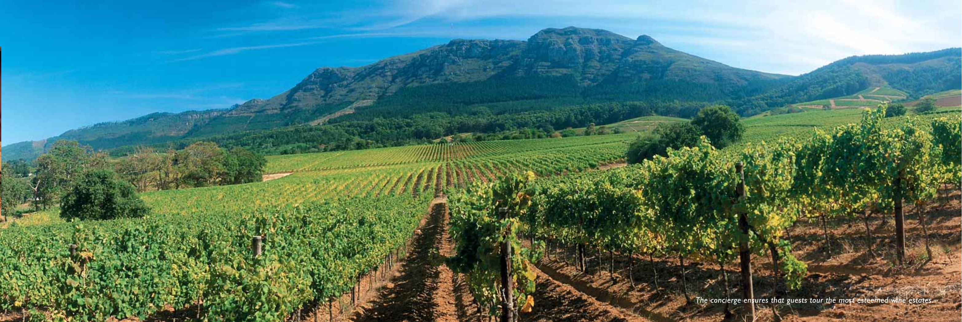
The concierge ensures that guests tour the most esteemed wine estates.

Framed by a stunning vista of Table Mountain and located within minutes of a dynamic city centre, lies one of Cape Town's finest hosts. The Mount Nelson Hotel offers guests a superb sanctuary of historical import, graceful charm and service excellence that extends far beyond the borders of the hotel.